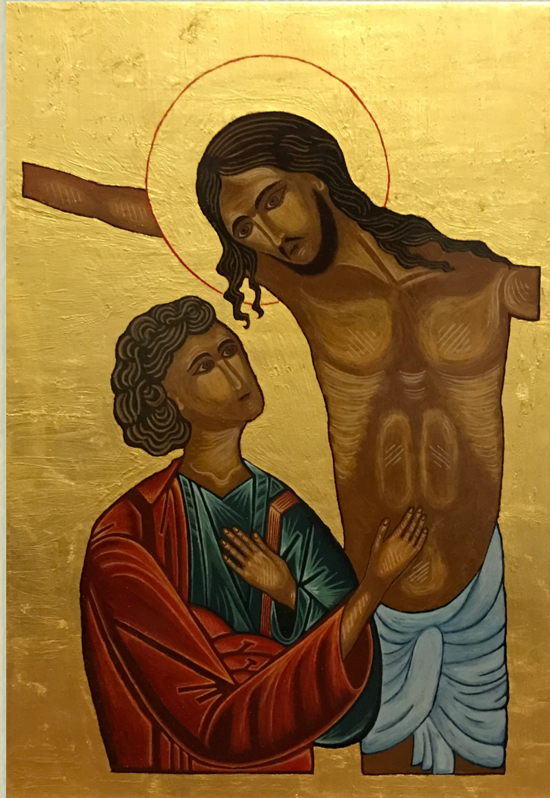
Gaze upon the Lord