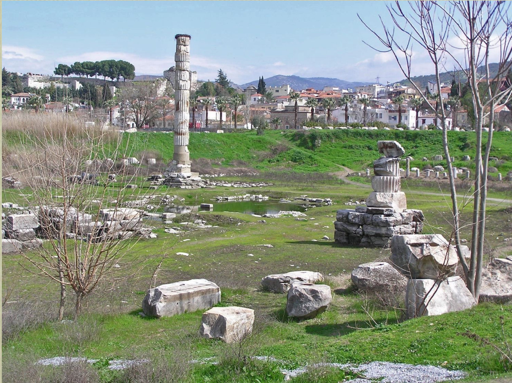
Temple of Artemis