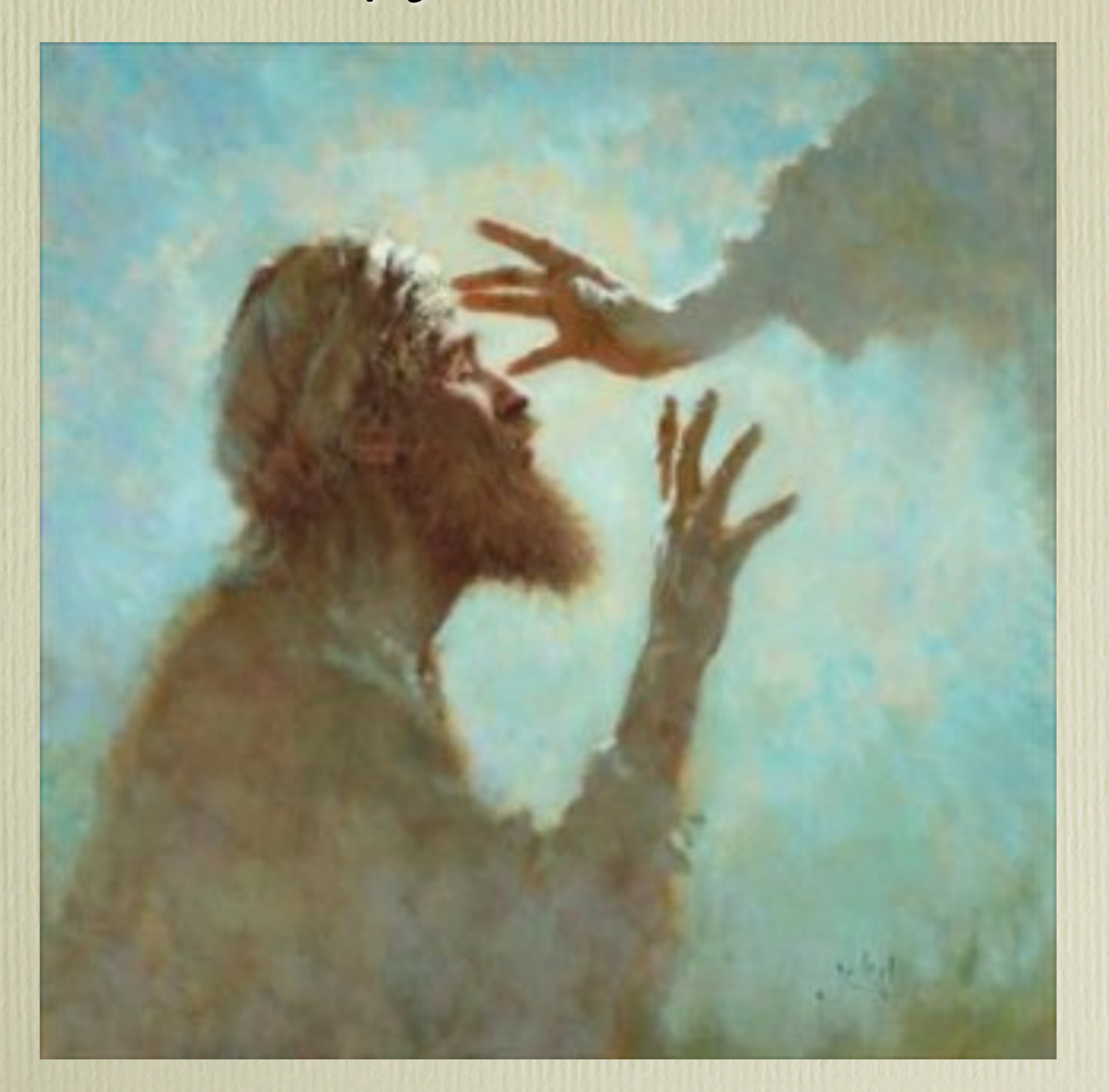
04. Jesus' Miracles