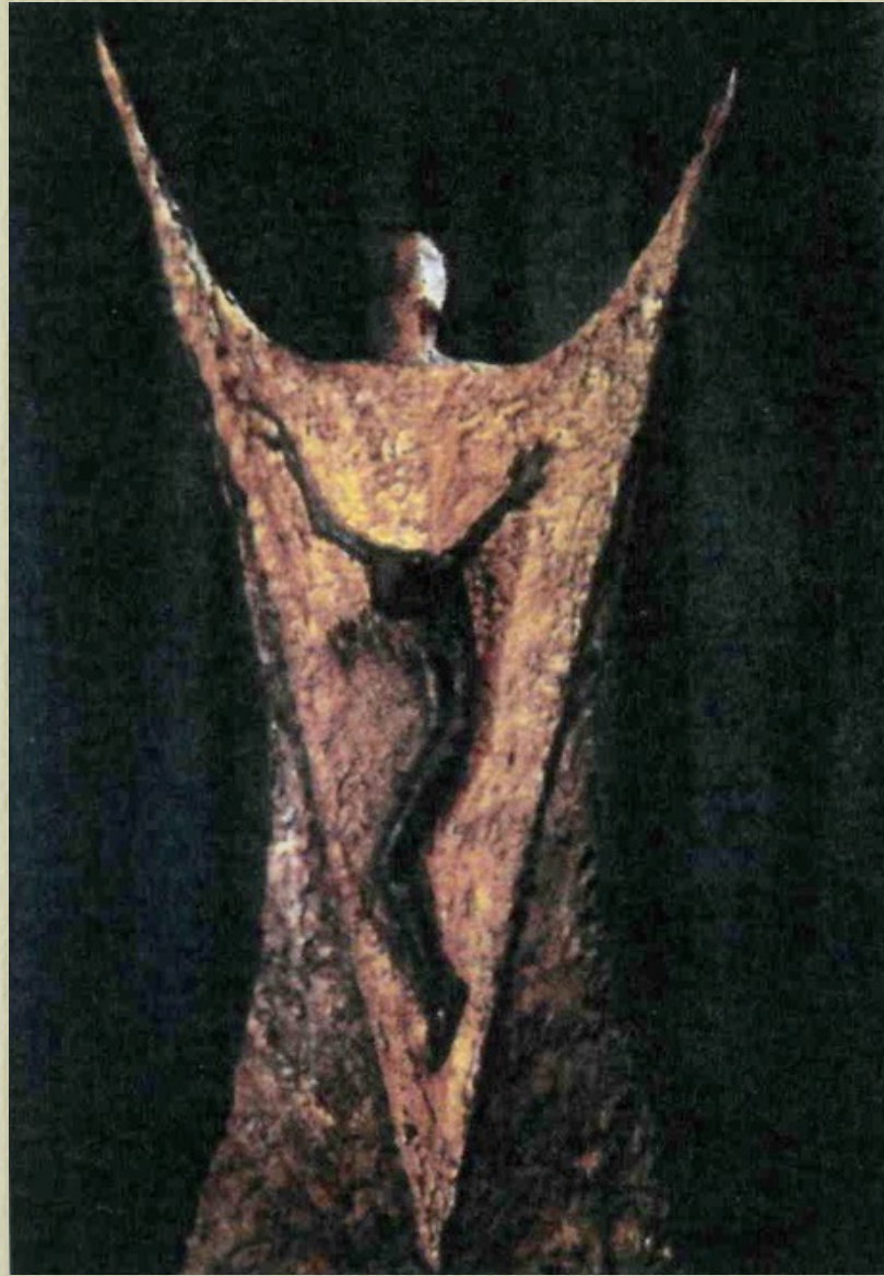
The Servant Song