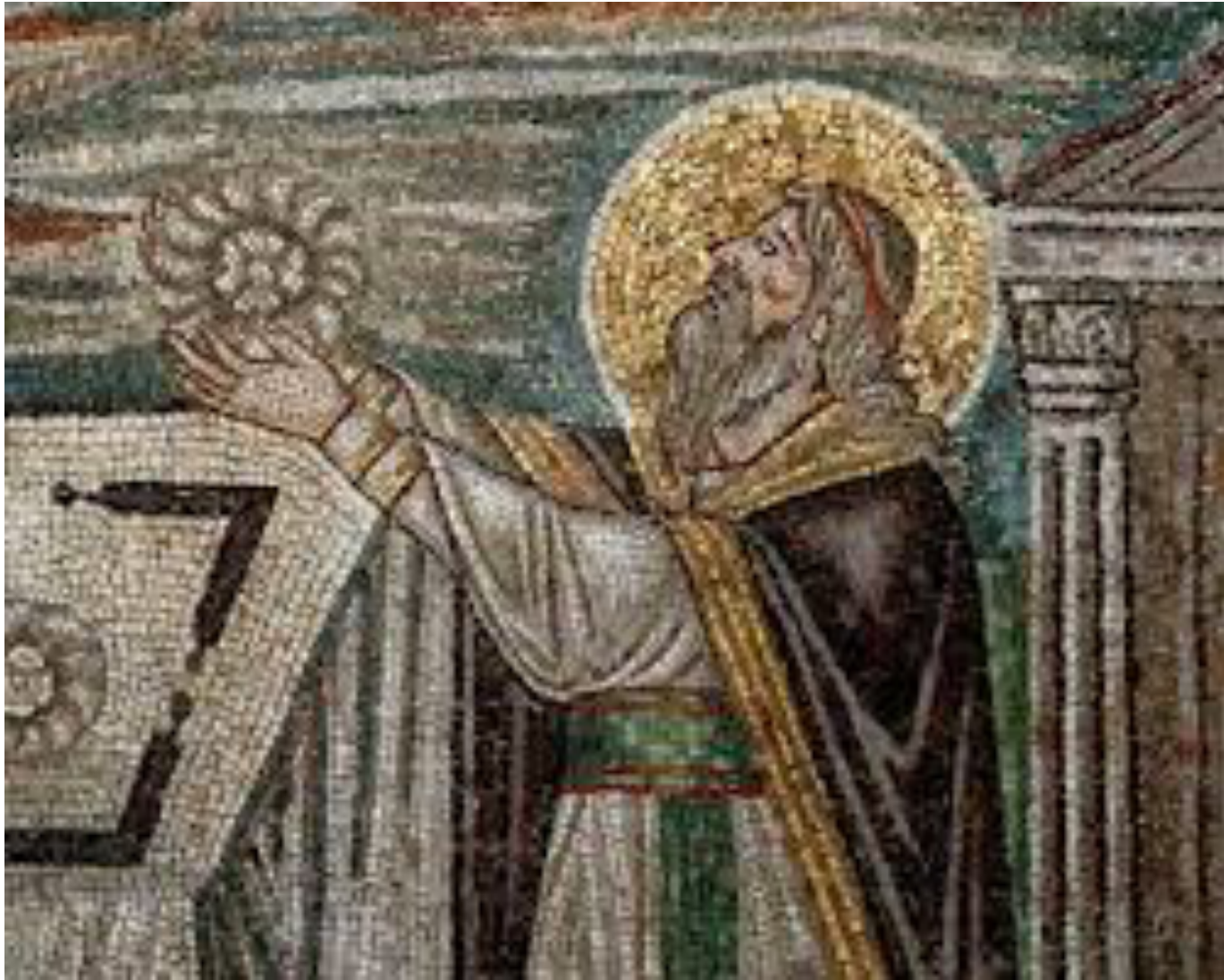
A Friend Broken