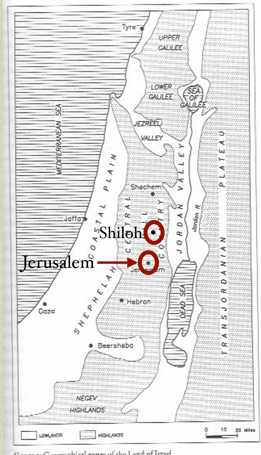
Figure 2: Geographical zones of the Land of Israel.

Go now to my place that was in Shiloh, where I made my name dwell at first, and see what I did to it for the wickedness of my people Israel. And now, because you have done all these things, says YHWH, and when I spoke to you persistently, you did not listen, and when I called you, you did not answer, therefore I will do to the house that is called by my name, in which you trust, and to the place that I gave to you and to your ancestors, just what I did to Shiloh. And I will cast you out of my sight, just as I cast out all your kinsfolk, all the offspring of Ephraim.