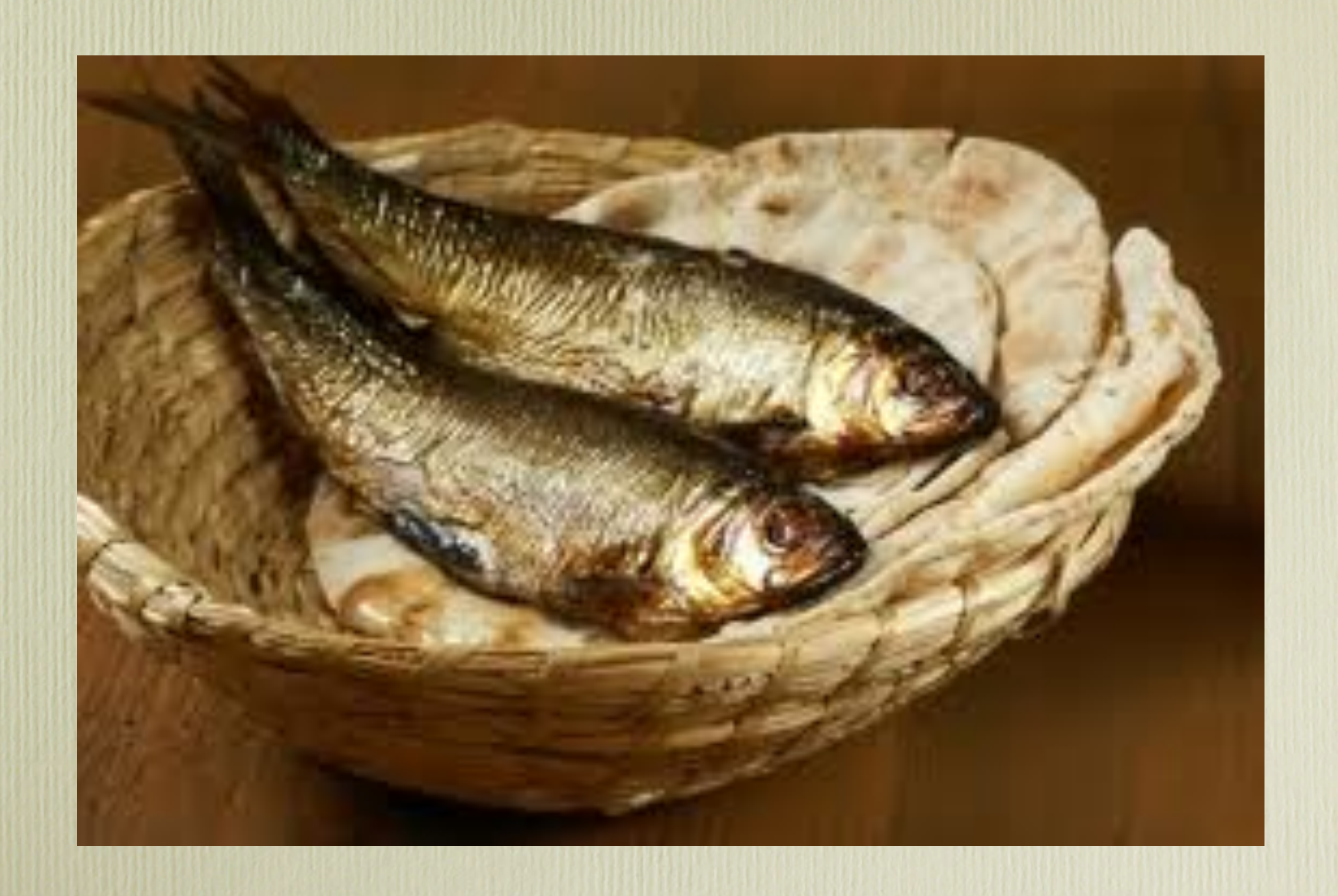
11. Mark 6:6b - 8:30