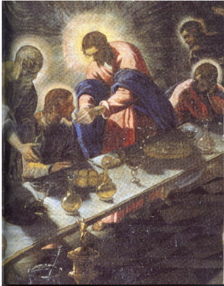
A Friend broken