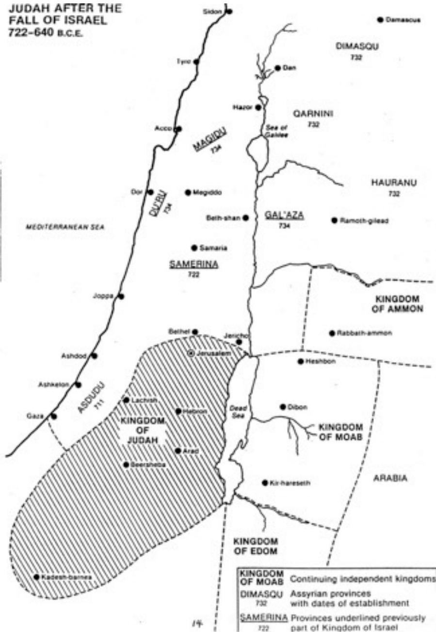
JUDAH AFTER THE FALL OF ISRAEL 722-640 B.C.E.