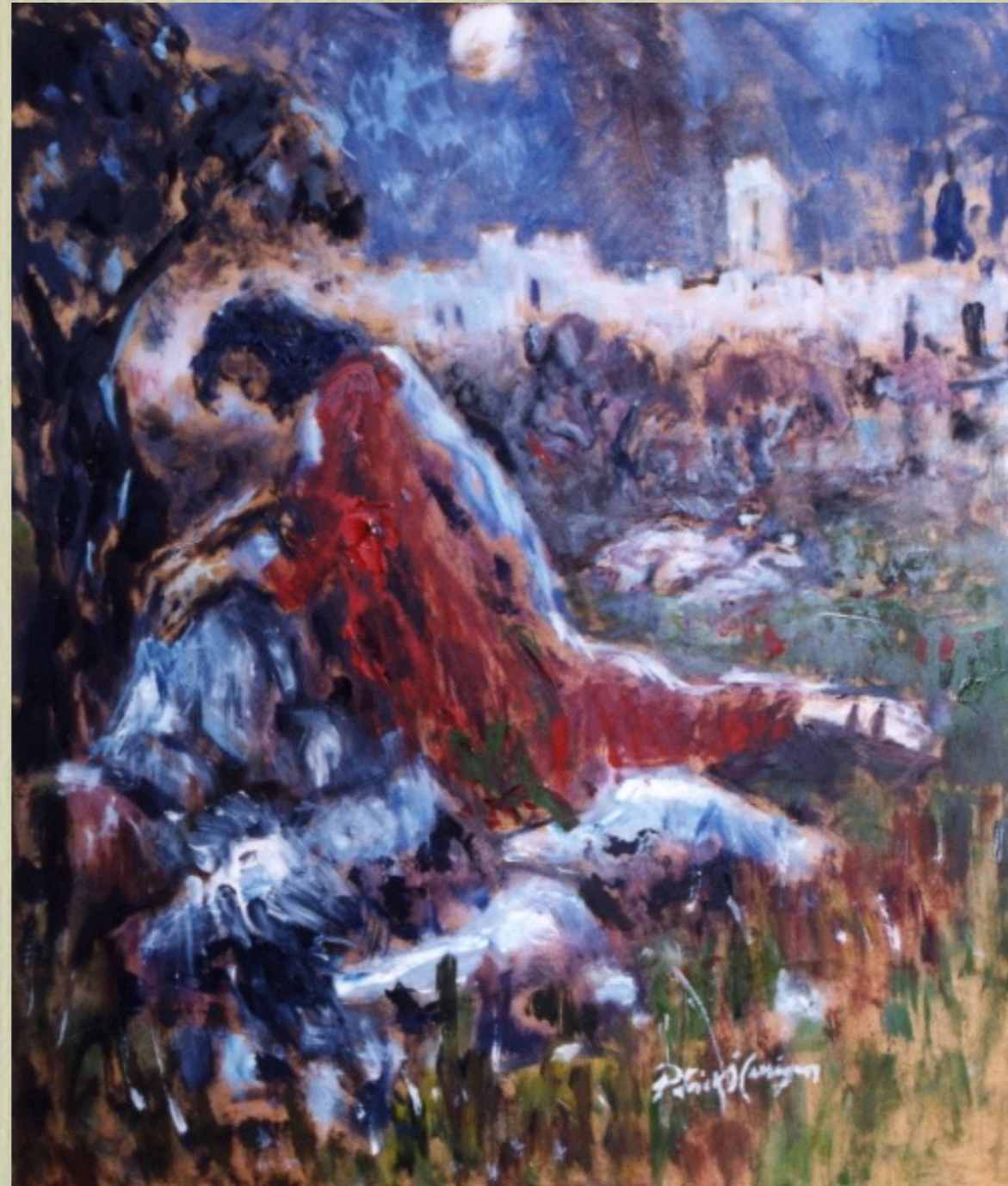
Prayer of Abandonment